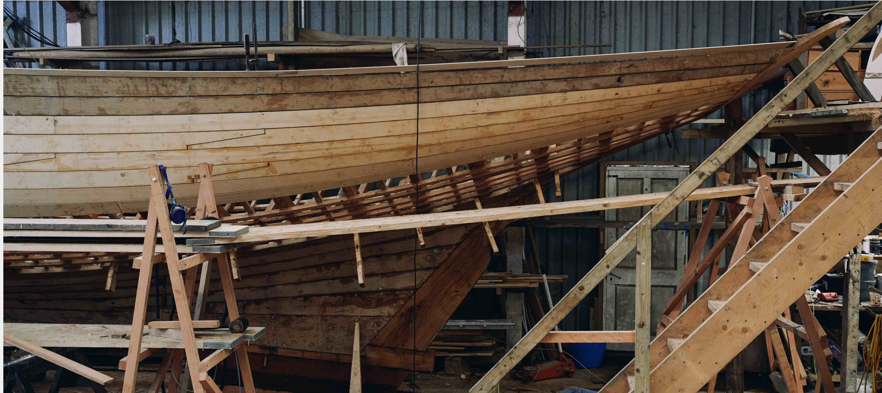
Progress shot, January 2026: The Malabar taking shape in the workshop. Centreline & frames complete, planking & deck underway.