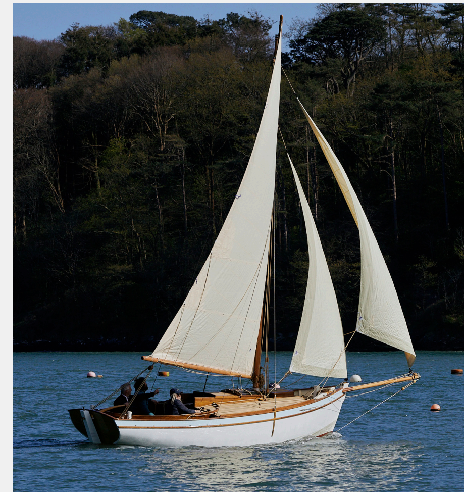
PANACEA & GALATEIA