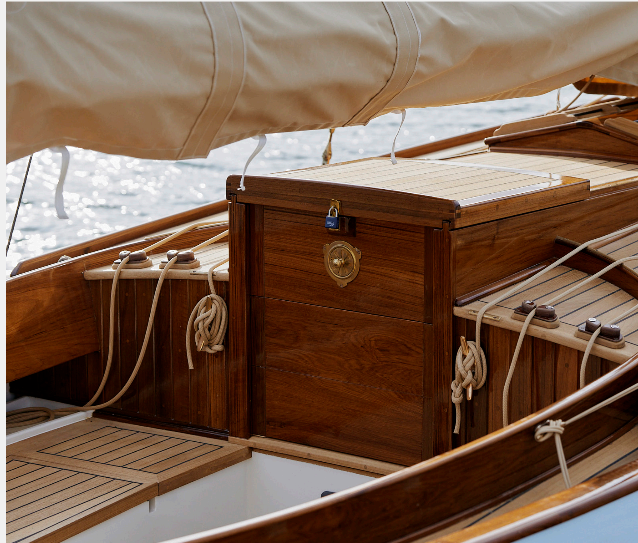
Galatea, one of our 23 foot Gaff Cutters built in 2022.

Engine choice, navigation & electronics, heating / cooling, sustainable power, plumbing, etc.