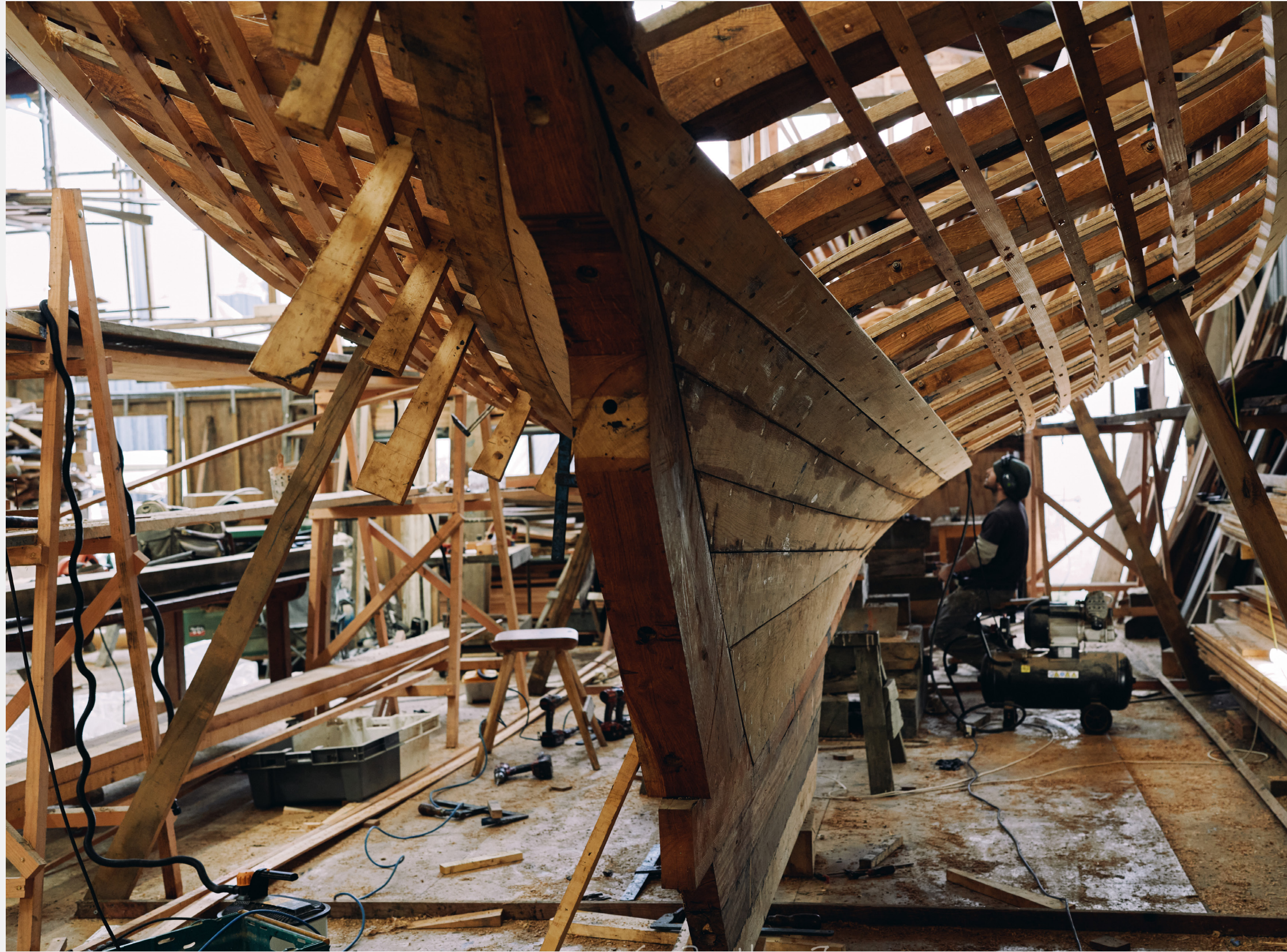
Progress shots showing detail of hull construction. January 2026.