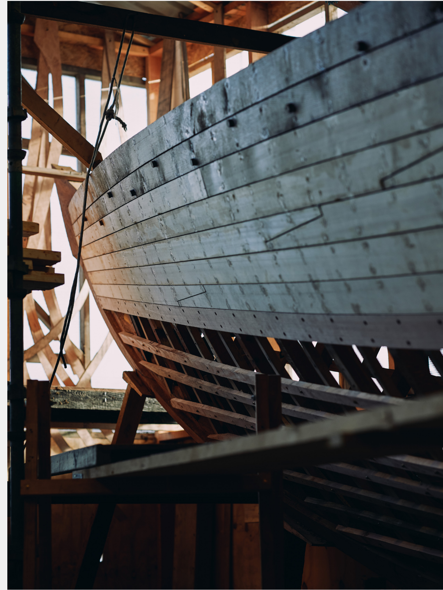
Progress shot: January 2026.