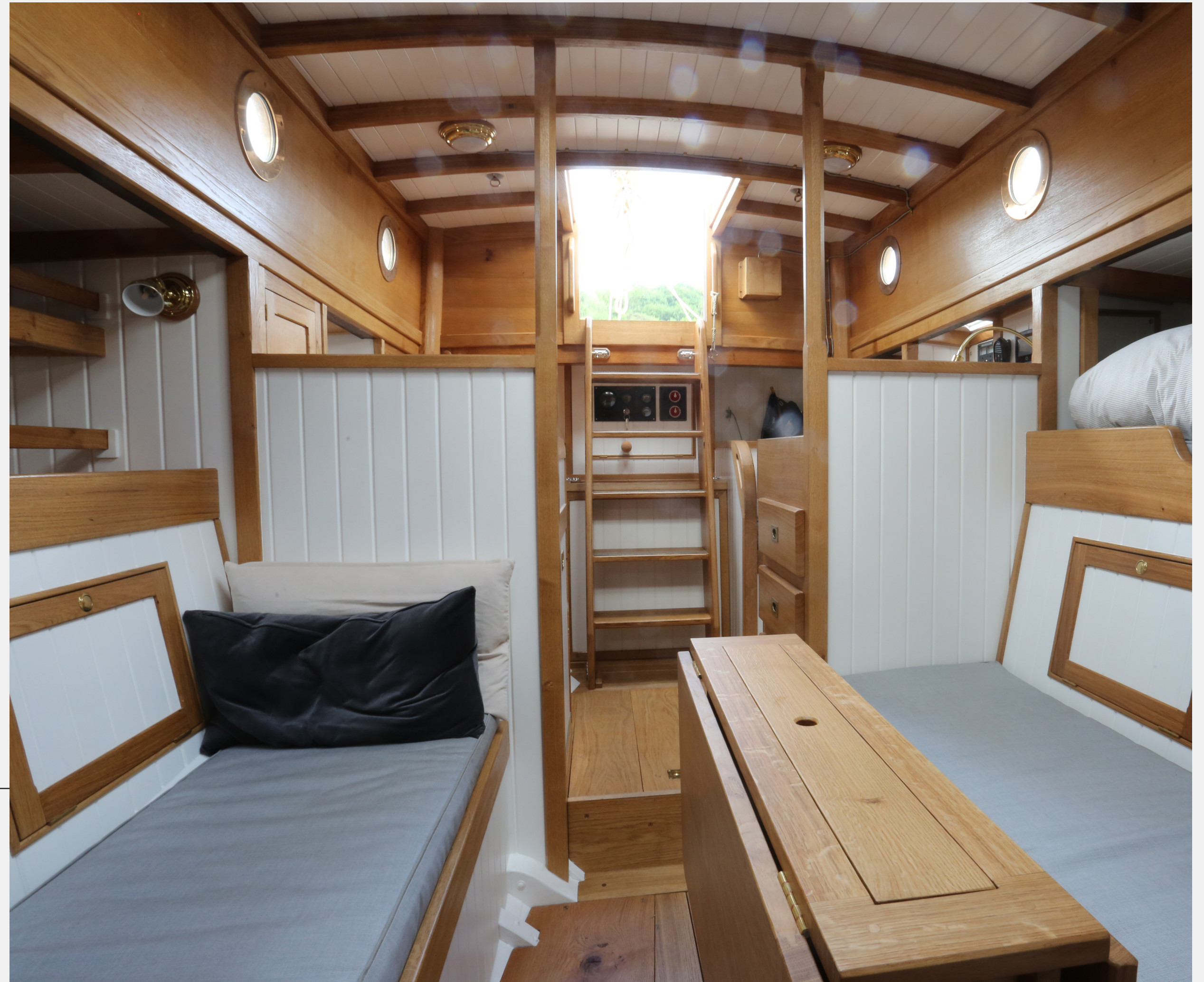
Image showing the interior of Constance, one of our most recent new builds